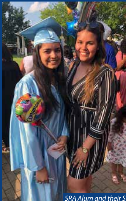
SRA Alum and their Sisters at Graduation